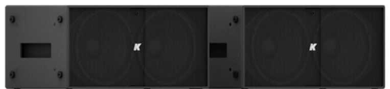
Suspended configuration with optional K-FLY3 flybar.